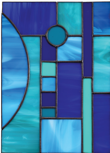
TRANSITIONS URN WITH CONTEMPORARY STAINED GLASS INSERT 800256