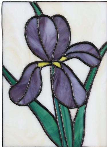
TRANSITIONS URN WITH PURPLE IRIS STAINED GLASS INSERT 800255