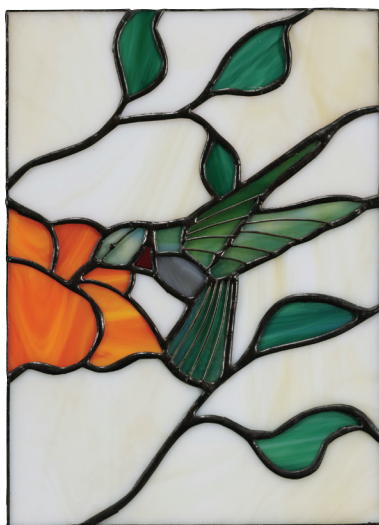
TRANSITIONS URN WITH HUMMINGBIRD STAINED GLASS INSERT 800253

This most iconic iris reflects wisdom, strength and courage. It is also a powerful symbol of faith and eternity.