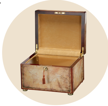
Shown with 800135 Bronze-finished Urn