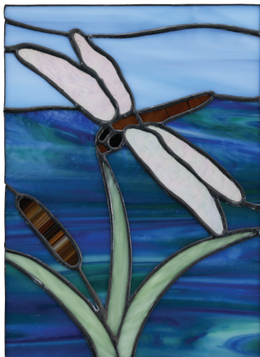
TRANSITIONS URN WITH DRAGONFLY STAINED GLASS INSERT 800258

For many bird lovers, the sight of a cardinal holds special meaning, sometimes evoking emotional or spiritual feelings. They say the vibrant red bird is an uplifting, happy sign that those we have lost will live forever, as we keep their memory alive in our hearts.