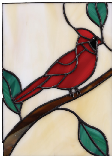
TRANSITIONS URN WITH CARDINAL STAINED GLASS INSERT 800252

This unique mantel urn includes a stained glass panel which is illuminated from behind. Choose from one of five options of hand-made stained glass panel, exclusively designed for Howard Miller.